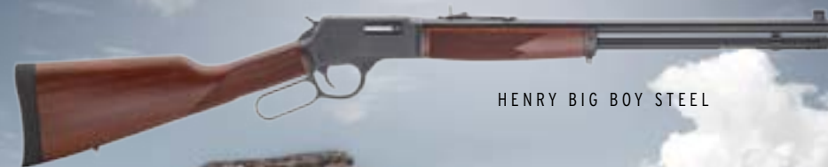
HENRY BIG BOY STEEL

THE HENRY BIG BOY STEEL WAS DESIGNED WITH THE MODERN HUNTER IN MIND. BUILT IN LINE WITH ALL HENRY LEVER ACTIONS, YOU CAN COUNT ON A SMOOTH, QUIET AND RELIABLE ACTION. THE HENRY BIG BOY STEEL FEATURES A 20" ROUND BARREL THAT WILL DELIVER THE ACCURACY YOU NEED. THE BARREL IS TOPPED WITH A FULLY ADJUSTABLE REAR SIGHT WITH WHITE DIAMOND INSERT AND A BEADED FRONT SIGHT.